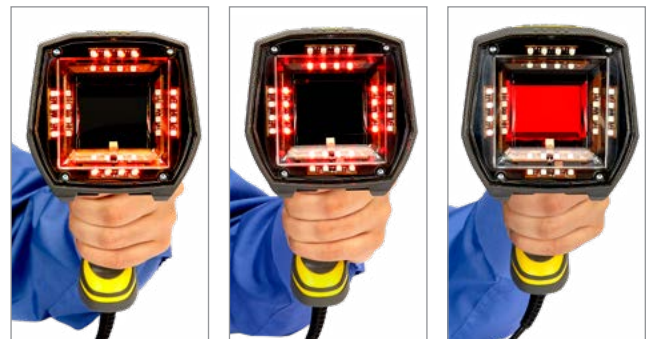
30-, 45-, and 90-degree lighting